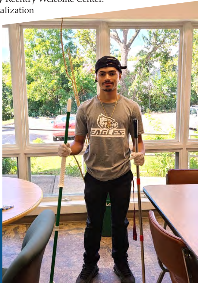
Post University volunteer at the Waterbury RWC.

The new Reentry Welcome Center in Waterbury is modeled after our successful center in Hartford. It serves people returning to Waterbury from prison at the end of their sentence. We thank Post University and look forward to continuing our new partnership.