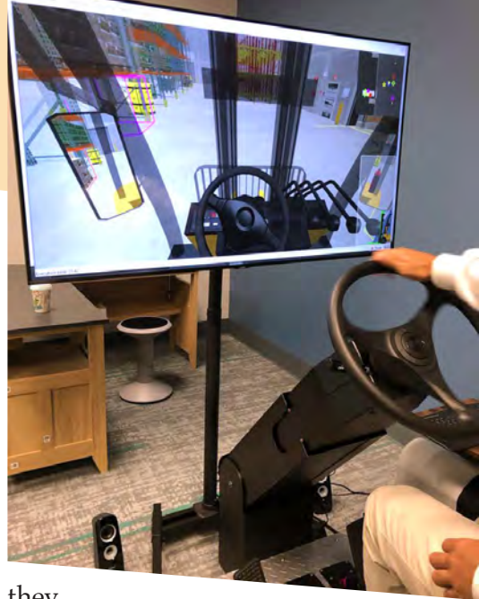
Participant using forklift simulator.